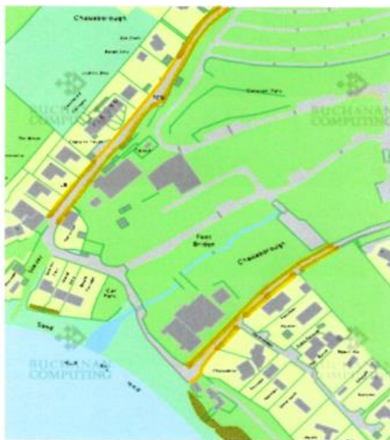
Fig 2: Proposal 1 Reinstate existing Traffic Order ( Fig1 ) and extend as shown in Fig 2

There is currently an existing Traffic Order in place which requires the installation of double yellow lines extending from Challadene to the sea front.