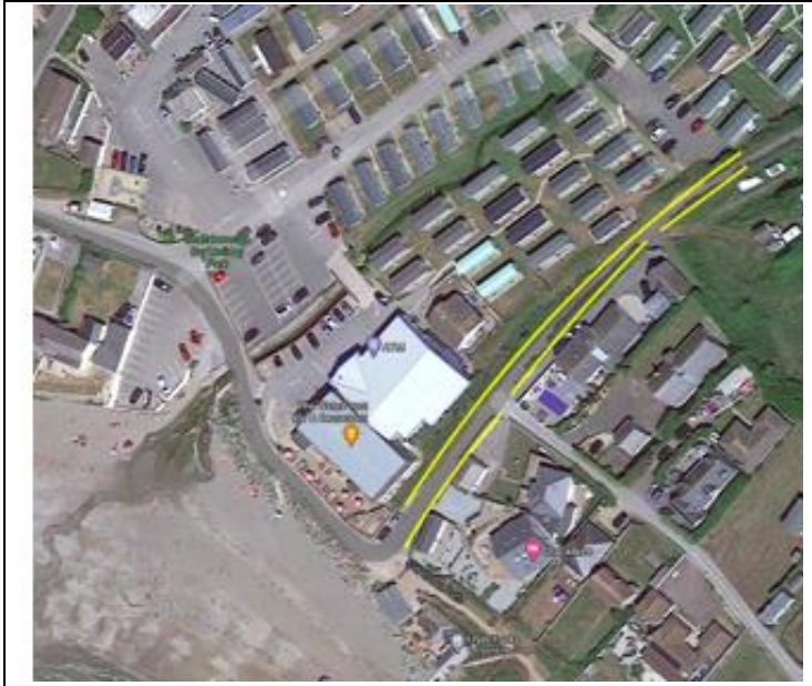
Fig 3: Seek small amendment to Existing Traffic Order and extend as show in Fig 3 to allow some free parking

There is an alternative proposal (Proposal 2) to start the yellow lines further back from the seafront to allow limited car parking in front of Fryer Tucks and on the corner of the road adjacent to Parkdean as shown on the plan below.