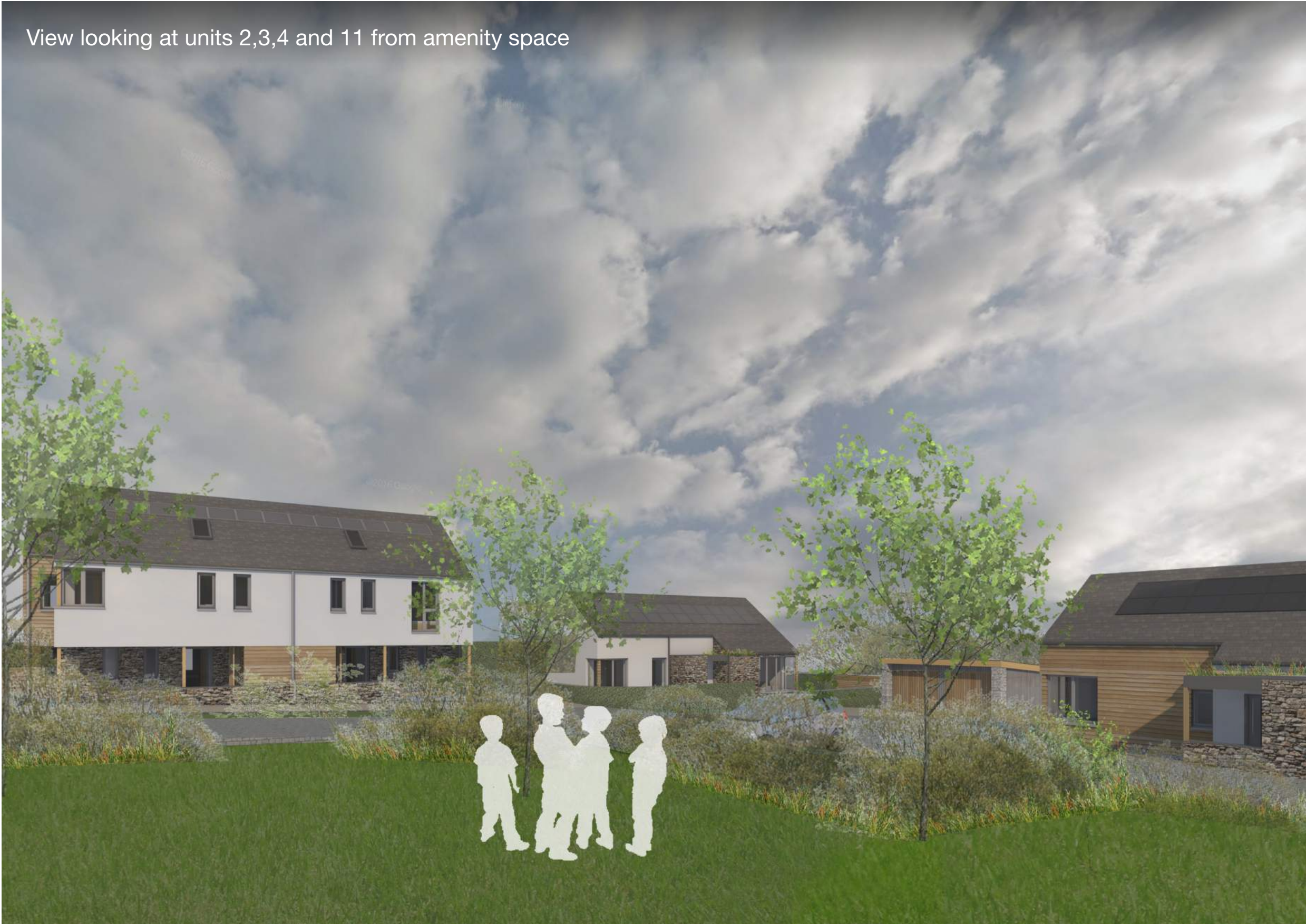
View looking at units 2,3,4 and 11 from amenity space